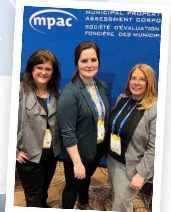
ROMA | Toronto