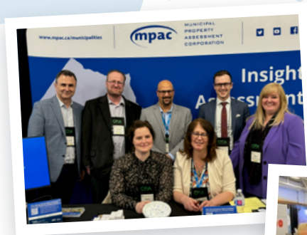
NOMA | Thunder Bay