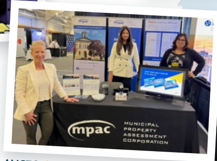
AMCTO | Blue Mountains