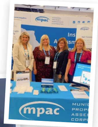
AMO | Ottawa